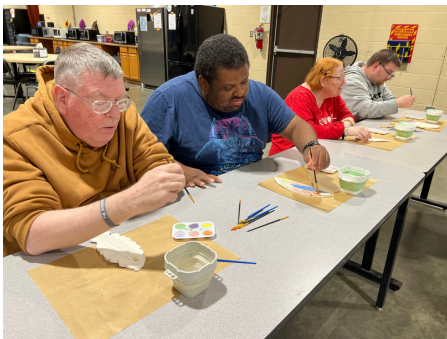
A group of consumers are taking part of a community art program, painting clay feathers to showcase their creativity.

Every day consumers come to Vodec with their own interests, talents, and goals. Some are discovering new skills for the first time and others are building confidence through routine and creativity. What they all share is the desire to be seen, to belong, to contribute. Our role is to meet people where they are and support them in ways that honor their individuality and potential.