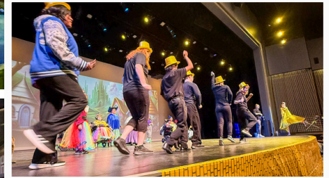
Left: The Audience rises to their feet during the curtain call at the close of the Wizard of Oz production

supportive in workshops and at the shows. We are very grateful for this partnership."