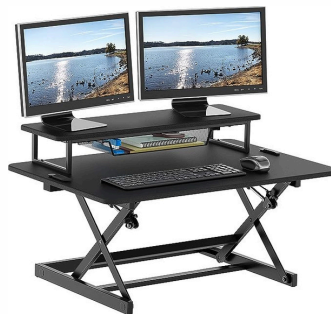
Adjustable Standing Desk