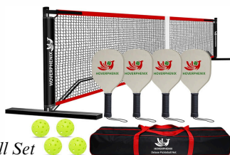
Pickleball Set with Net