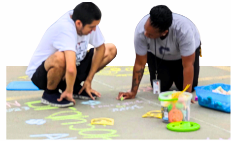
Scenes from Vodec Days Past