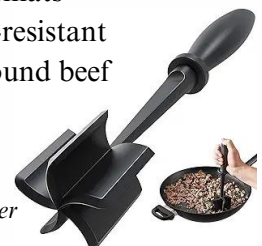
Handheld heat-resistant smasher