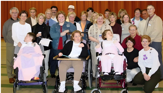
(Left) Attendees of the first Elm parents meeting at JP Lord School in Omaha in place for a group photo. This group helped create the Elm program, Vodec's first program in Nebraska.