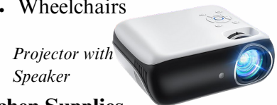
Projector with Speaker