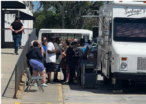
(Above) Vodec consumers in line at one of the Food trucks available during last years Vodec Days in Omaha