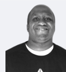
Snoopy: Steven Goodwin