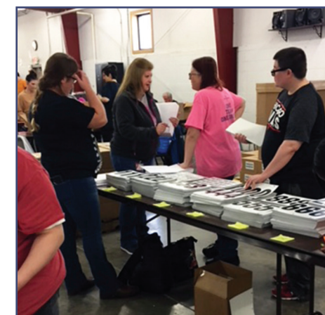
Vodec consumers work on a project for Cenveo clien R.J. Reynolds. It's one of several projects that Vodec regularly does for Cenveo, one of the top suppliers of printed labels in North America.