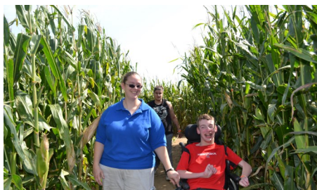
Iowa CARES visits the pumpkin patch

At checkout, the store will offer you a ten cent per bag discount for every reusable sack you use. Your cashier will ask if you would like that discount applied to your shopping bill, OR if you’d prefer to give the dimes to this quarter’s community organization.