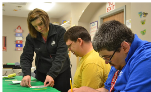
Nebraska CARES designs Christmas cards

Whole Foods Market is at 10020 Regency Circle, Omaha, 68114.