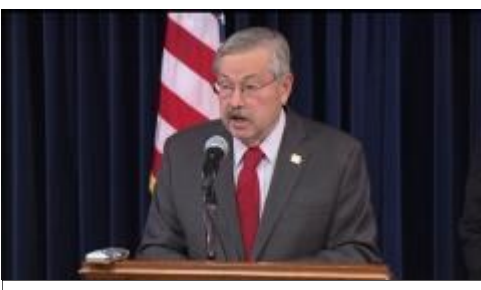
Iowa Governor Terry Branstad announces Medicaid Modernization.

Buckle your seat belts, Iowa's Medicaid Modernization has entered its implementation phase. Starting January 1st, the four Managed Care Organizations (MCO) the State has selected begin administrative oversight for Medicaid services and payment.