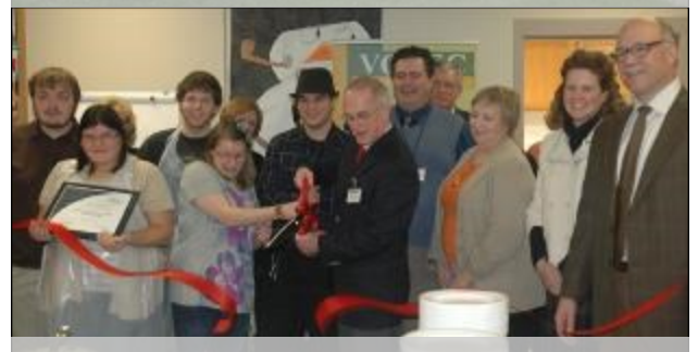
ATP Kitchen renovation ribbon-cutting

4th Street Duplex has undergone major renovations