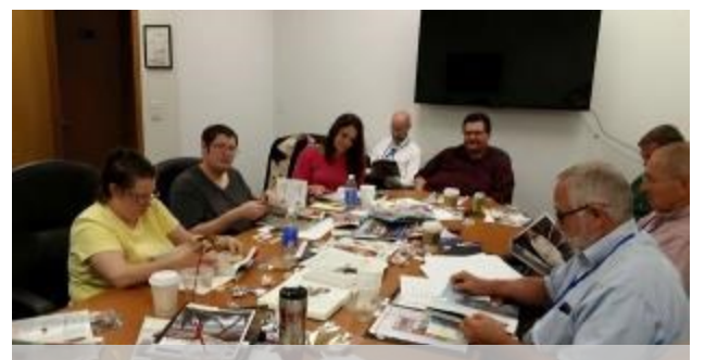
Staff focus group begins branding development work