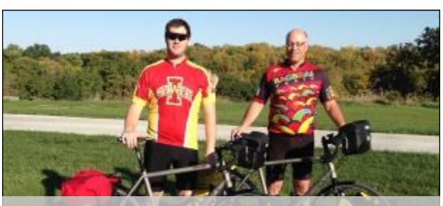
Bikers ride 4000 miles for renovations