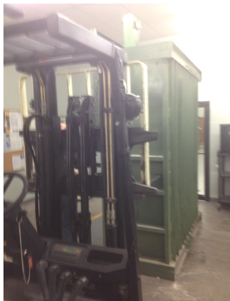
Baler Removal in Council Bluffs