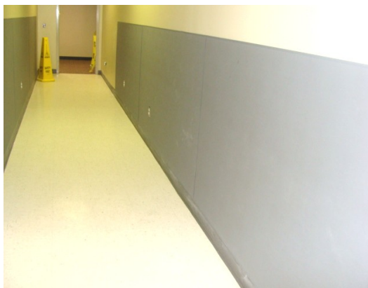
New wall protection in ELM

At our F street location we have repainted the ELM area and are in the