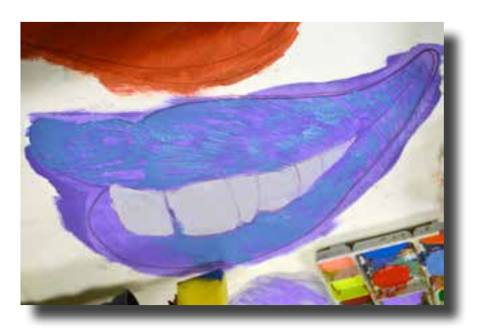
(Above)- One of the finished shapes that was cut out and placed on the wall at Tip Top Thrift Shop.