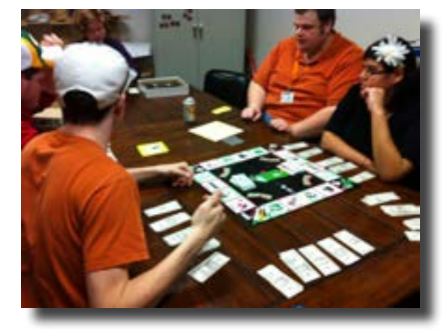
(Above) Adult Transition Students play a game of Monopoly to enhance their money skills.